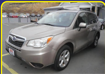
2015 SUBARU FORESTER 2.5L H4, AT STOCK #: 26744