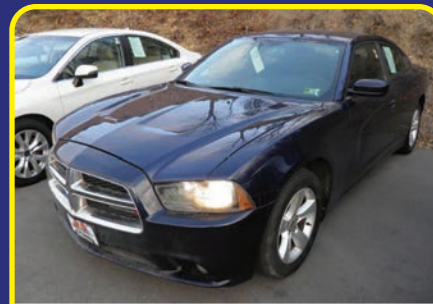
2014 DODGE CHARGER 3.6L V6, 4DR, AT STOCK #: 16827X