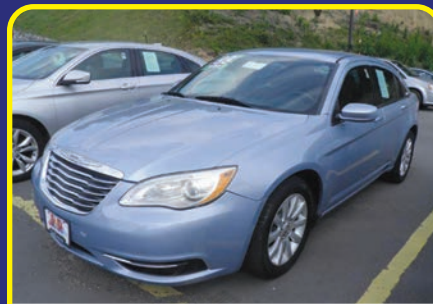
2014 CHRYSLER 200 2.4L I4, 4DR, AT STOCK #: 16779X