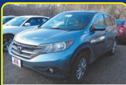
2014 HONDA CRV AWD • AT • 2.4L STK# 26866