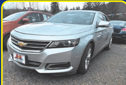
2014 CHEVY IMPALA AT • 3.6L STK# 27348