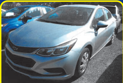
2018 CHEVY CRUZE AT • 1.4L STK# 24990

DD-Motors.com 301-463-2404 DD-Motors.com