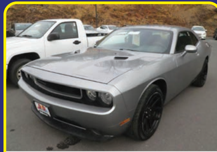
2014 DODGE CHALLENGER 3.6L V6, 2DR, AT STOCK #: 26112