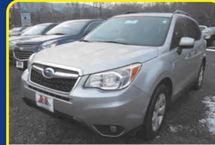
2015 SUBARU FORESTER AWD • AT • 2.5L STK# 27130