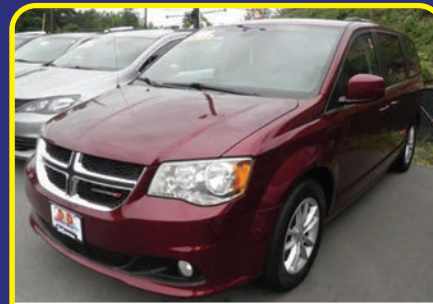
2019 DODGE GRAND CARAVAN 3.6L V6, AT STOCK #: 26000