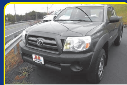
2019 TOYOTA TACOMA 4X4 • AT • 4.0L STK# 26306