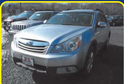
2012 SUBARU OUTBACK AWD • AT • 2.5L STK# 26960