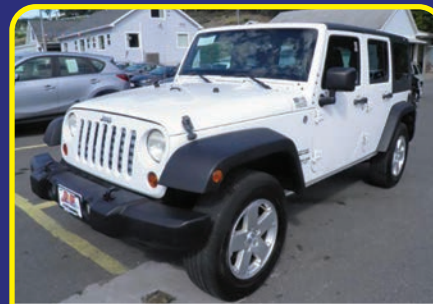
2013 JEEP WRANGLER UNLIMITED 3.6L V6, AT STOCK #: 17603X

CALL: 301-729-3700 for a Sales Appt. and SAVE $200!