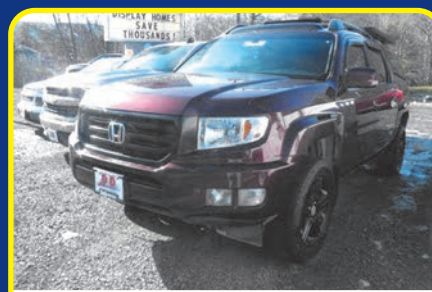
2012 HONDA RIDGELINE 4X4 • AT • 3.5L STK# 26750