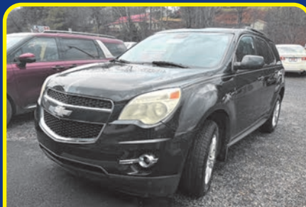
2012 CHEVY EQUINOX AWD • AT • 3.6L STK# 26258