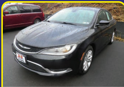
2017 CHRYSLER 200 2.4L I4, 4DR, AT STOCK #: 26644