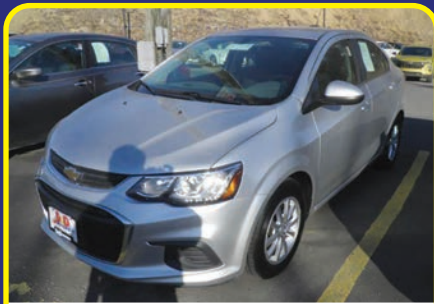
2020 CHEVROLET SONIC 1.4L I4, 4DR, AT STOCK #: 16905X