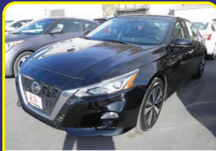
2019 NISSAN ALTIMA 2.5L I4, 4DR, AT STOCK #: 27134