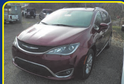
2020 CHRYSLER PACIFICA AT • 3.6L STK# 26238