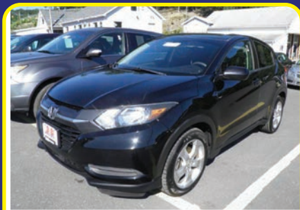
2018 HONDA HR-V 1.8L I4, AT STOCK #: 26398