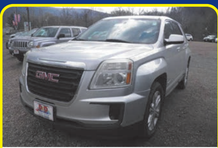
2017 GMC TERRAIN AWD • AT • 2.4L STK# 26834