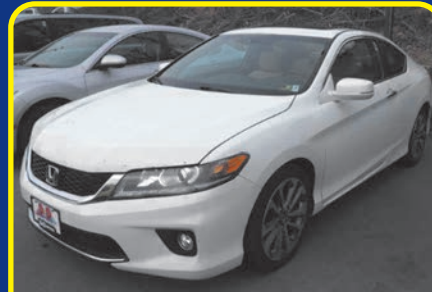
2014 HONDA ACCORD AT • 3.5L STK# 17137X