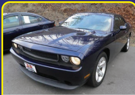
2014 DODGE CHALLENGER 3.6L V6, 2DR, AT STOCK #: 26174