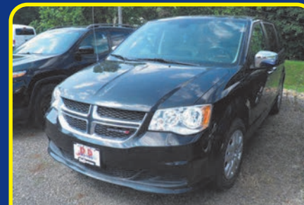
2018 DODGE CARAVAN AT • 3.6L STK# 25668