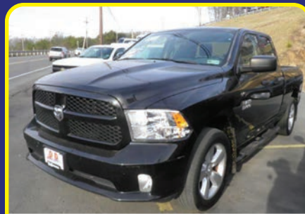
2015 DODGE RAM 1500 3.6L V6, AT STOCK #: 26628