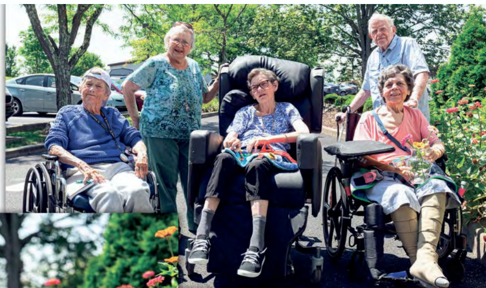
Residents of Sundale Nursing Home enjoy recent time outdoors.