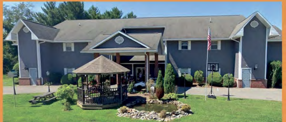
Assisted Living at Evergreen in Morgantown, WV

Assisted Living at Evergreen is an alternative to nursing home care. A variety of specially developed leisure activities include outings to Oglebay, holiday dinners and parties and weekly shopping trips. Housekeeping and personal laundry services are available. There are community areas, dining and family rooms, an activity center and a gazebo with fish pond for outdoor relaxing.