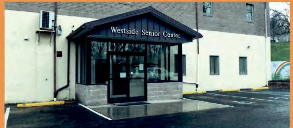
Westside Senior Center

54 W. Highland Avenue, Masontown • 304-864-6465