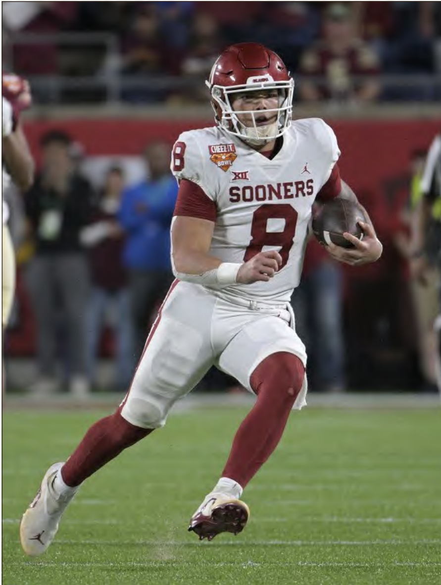
Oklahoma quarterback Dillon Gabriel.