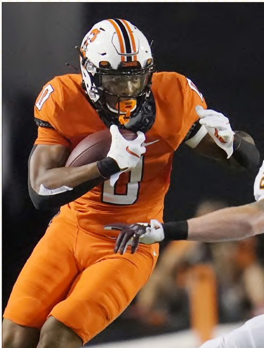
Oklahoma State running back Ollie Gordon.