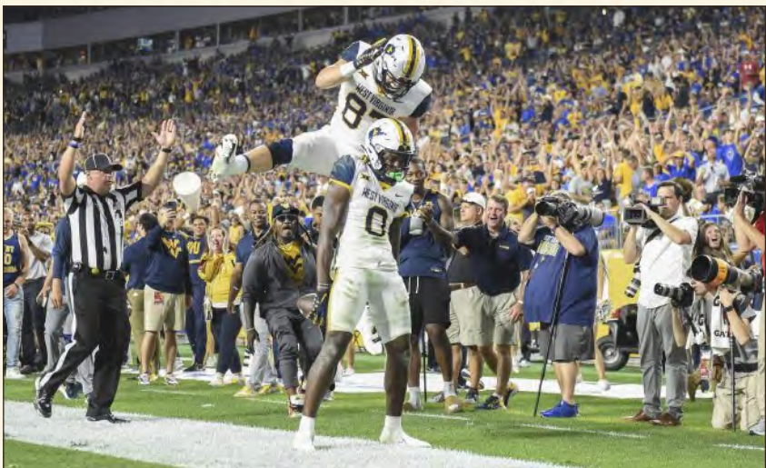
William Wotring/The Dominion Post