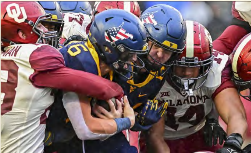
William Wotring/The Dominion Post