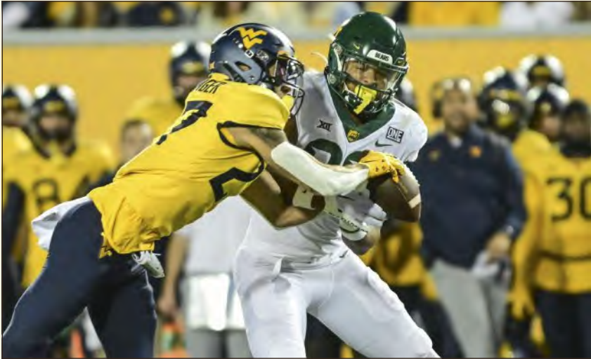
Game 6: W, 43-40 vs. No. 23 Baylor