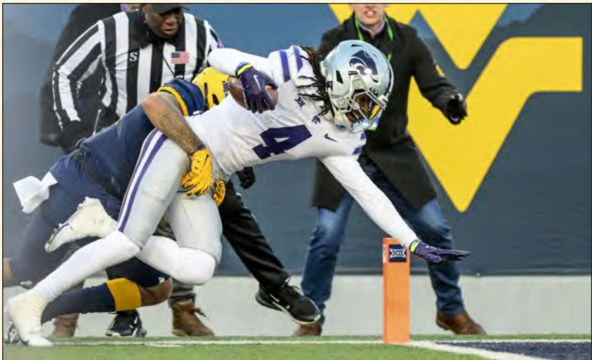
William Wotring/The Dominion Post