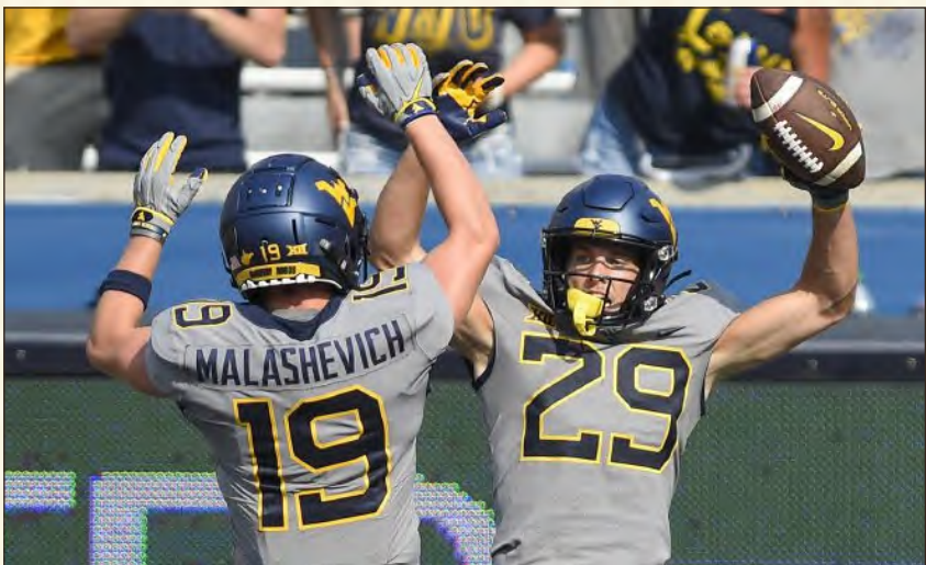
William Wotring/The Dominion Post