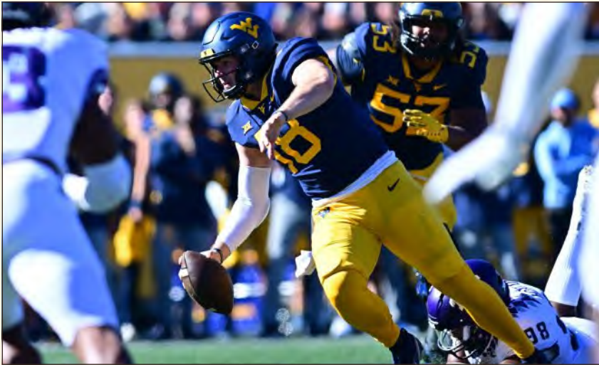
Game 8: L, 41-31 vs. No. 7 TCU