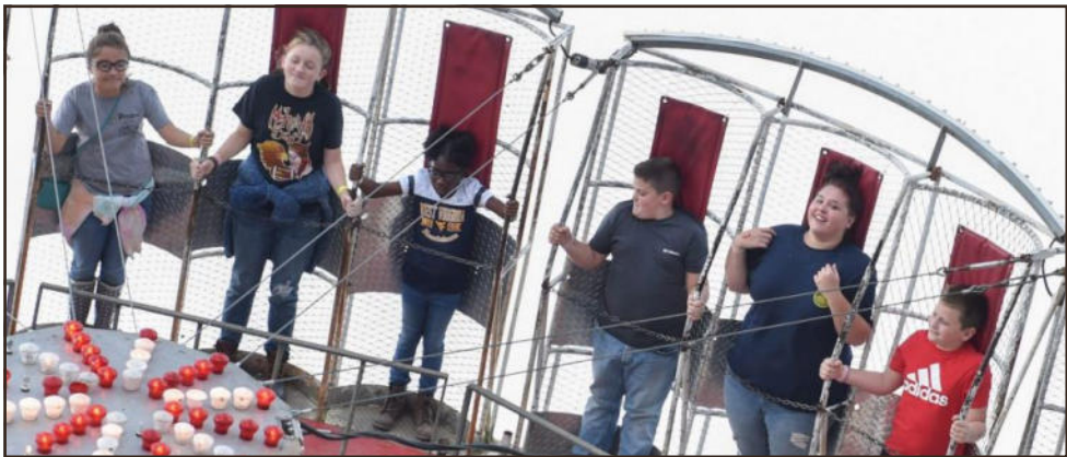
Clockwise from above: Cow Palace will be the place to go to see livestock such as this cow during the Buckwheat Festival. Check out the parades such as this Firemen's Parade from 2021 in which Central Preston Middle band participated. There will be parades Thursday, Friday and Saturday. Carnival rides will again be part of the activities Thursday through Sunday.